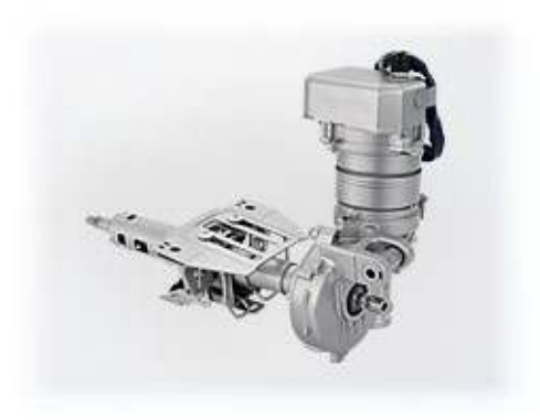
Column type EPS

103. Examples of Electric Powered Steering Assemblies manufactured by certain of the Defendants are shown below.