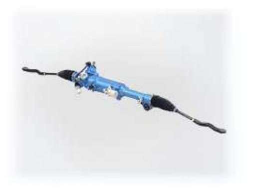
Dual pinion type EPS