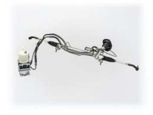
Rack direct drive type EPS