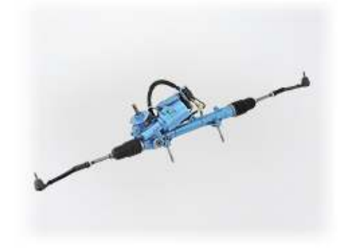
Pinion type EPS